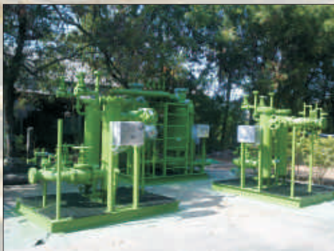
IOCL - PARADEEP HEATLESS