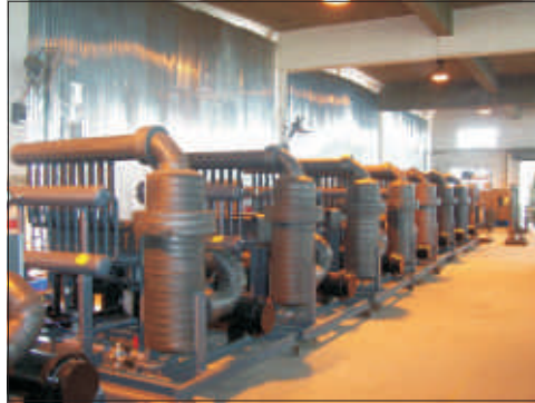
NTPC SIPAT Refrigeration