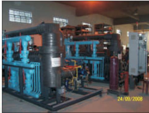
TNPL Blower Reactivated Air Dryer