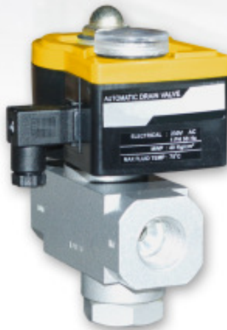
EDV X SS40