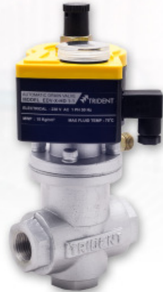
EDV X HD11